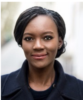
Rama Yade, Senior Fellow, Atlantic Council